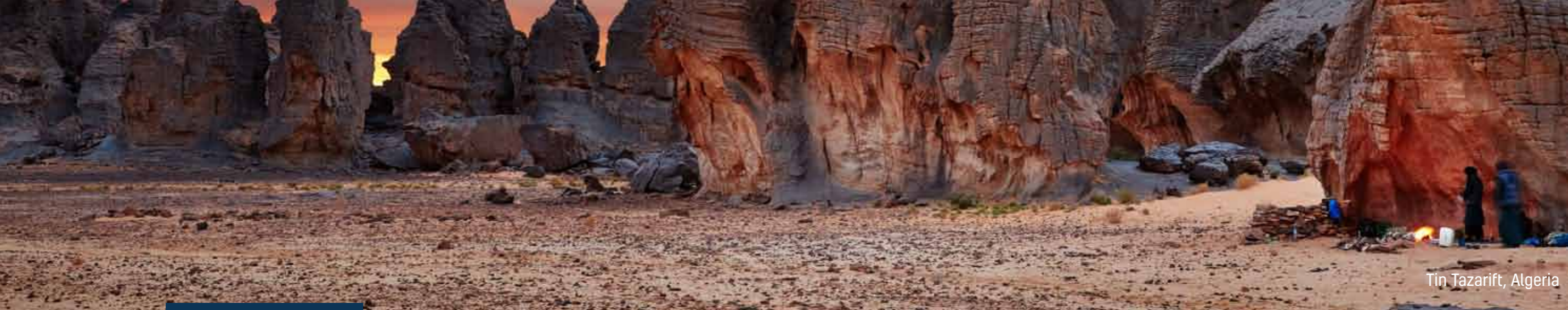
Tin Tazarift, Algeria